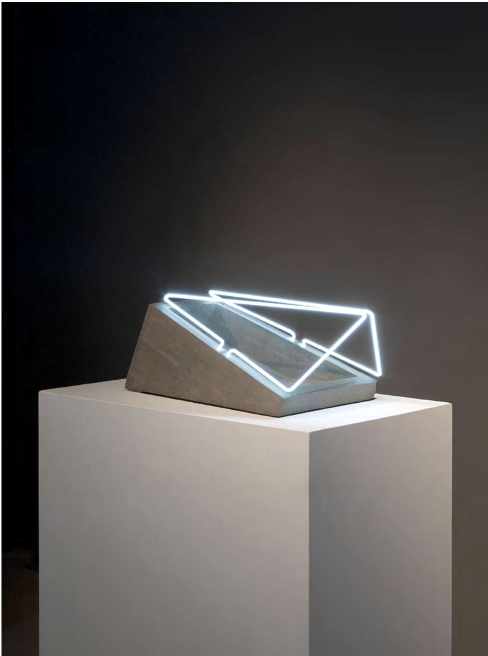
MORGANE TSCHIEMBER OPEN SPACE 1 (TRAPÈZE) 2016 CONCRETE, LIGHT FITTINGS H20 L50 W32 CM / H7.9 L19.7 W12.6 IN LIMITED EDITION OF 8 + 4 AP