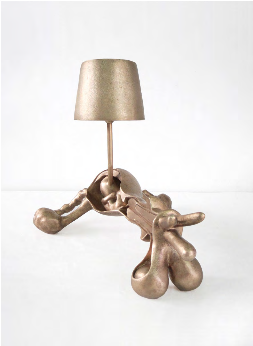
ATELIER VAN LIESHOUT PAPPAMAMMA LAMP BRONZE 2013 BRONZE H40 L50 W40 CM / H15.7 L19.7 W15.7 IN LIMITED EDITION OF 7 + 5 AP