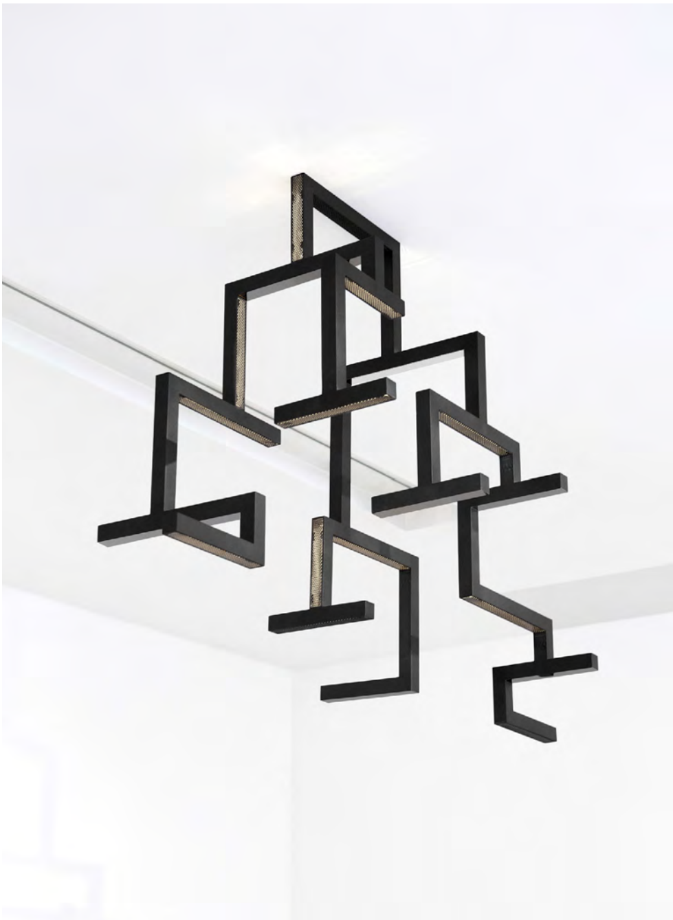
JOHANNA GRAWUNDER GOLDBAR (DARK GREY) 2016 PAINTED ALUMINIUM, PERFORATED STEEL, POLISHED STEEL, LEDS H122 L180.5 W84 CM / H48 L71 W33 IN LIMITED EDITION OF 8 + 4 AP