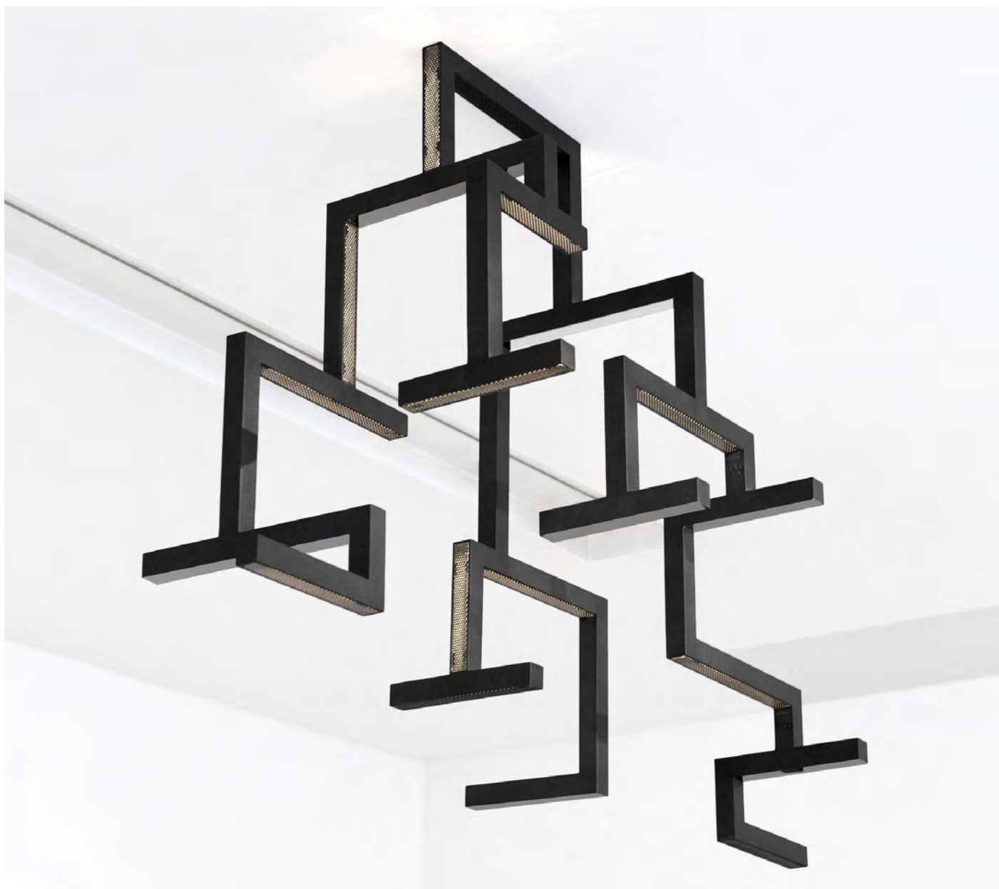
JOHANNA GRAWUNDER | GOLDBAR (BLACK) | 2013

PRESS PREVIEW THURSDAY 26 JANUARY 2017, 6 – 9 PM