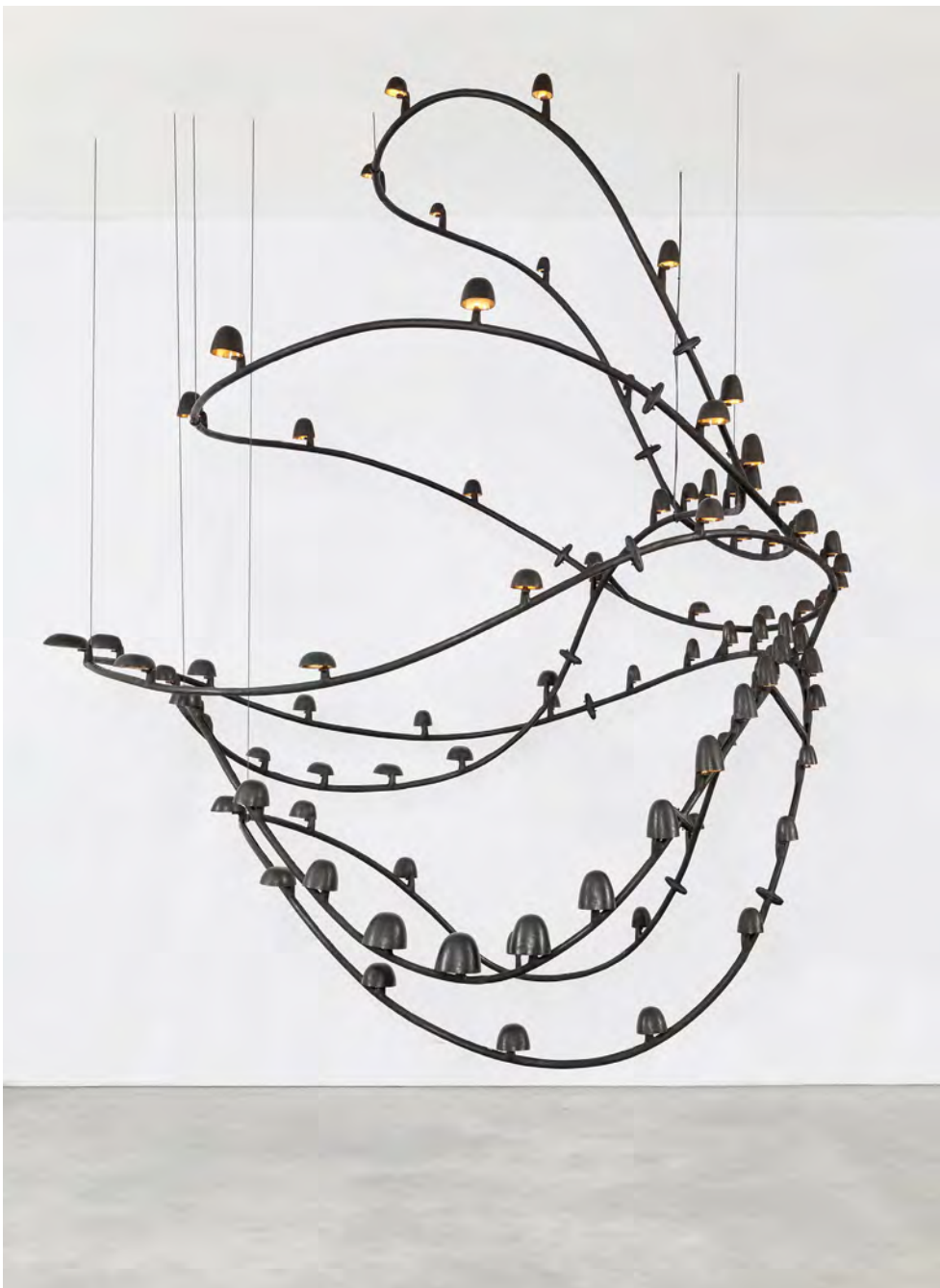
FREDERIK MOLENSCHOT CL-MANHATTAN 2016 BRONZE, LED H300 L260 W230 CM / H118.1 L102.4 W90.6 IN LIMITED EDITIONS OF 8 + 4 AP