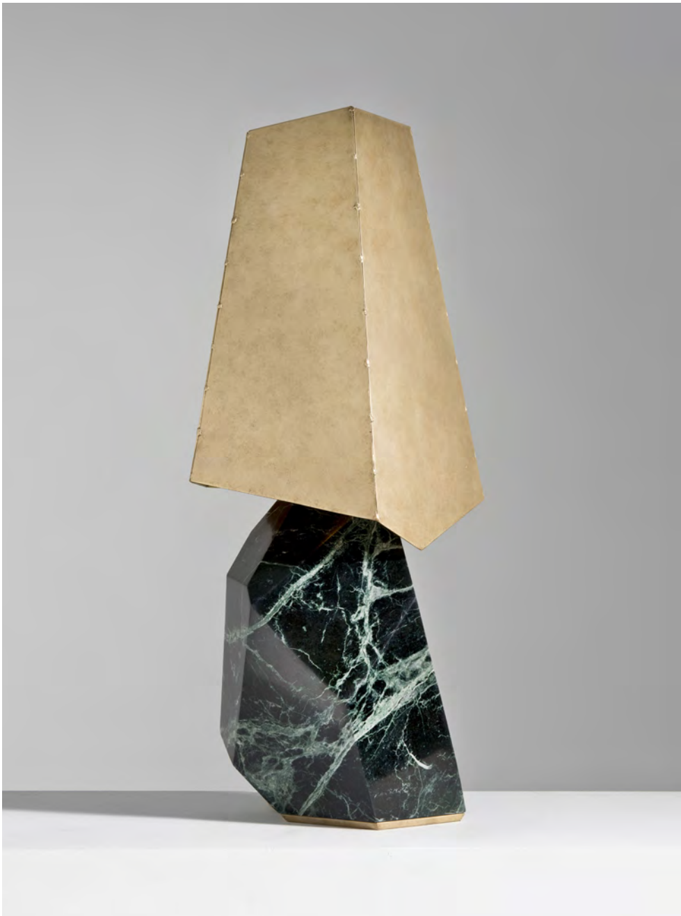
GIACOMO RAVAGLI BAROMETRO TABLE LAMP 2.1 2016 GREEN ALPI MARBLE, BRASS AND LIGHT FITTINGS H78 L35 W25 CM / H30.7 L13.8 W9.8 IN LIMITED EDITION OF 8 + 4 AP