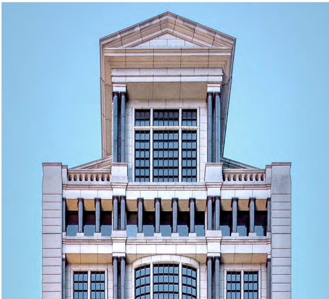
NEW YORK | CARPENTERS WORKSHOP GALLERY