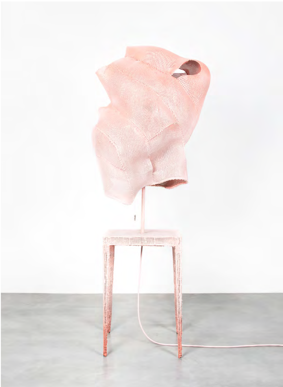
NACHO CARBONELL TABLE COCOON 12 2015 STEEL FRAME, METAL MESH AND PAVERPOL MIX H217 L62 W62 CM / H85.4 L24.4 W24.4 IN UNIQUE