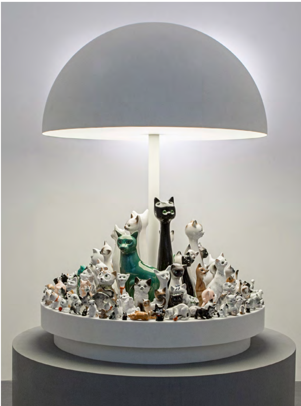
STUART HAYGARTH RAFT CATS (LARGE) 2009 CORIAN, SPUN METAL SHADE AND CAT FIGURINES, WARM LOW ENERGY BULB H125.5 D88 CM / H49.4 D34.6 IN LIMITED EDITION OF 3 + 1 AP