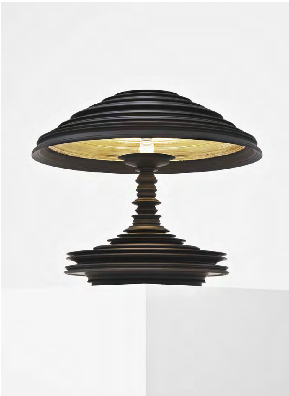
SEBASTIAN BRAJKOVIC LATHE LAMP (DARK GREY) 2011 ANODIZED ALUMINIUM H48 D54 CM / H19 D21.5 IN LIMITED EDITION OF 8 + 4 AP