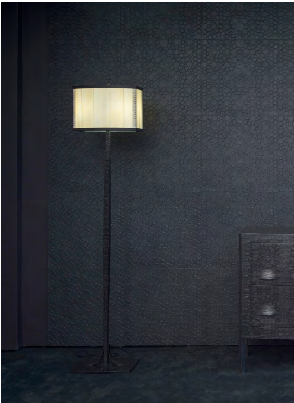
INGRID DONAT LAMPADAIRE LAM 2016 BRONZE, WOOD, GLASS H200 L44.5 W27 CM / H78.7 L16.3 W10.6 IN PAIR IN LIMITED EDITION OF PROTOTYPE + 8 + 4 AP